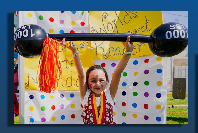
Interventions and Supports that lead to Student Success